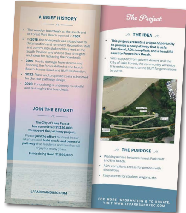
Forest Park Beach Pathway Project Brochure https://lfparksandrec.com/forest-park-beach-pathway-project?tab=239

Currently the pathway reconstruction is not part of the stabilization project. Fundraising for the pathway began earlier this year. The project hopes to raise $1,500,000 million in private funds in addition to the $1,336,000 the City of Lake Forest has committed for the project.