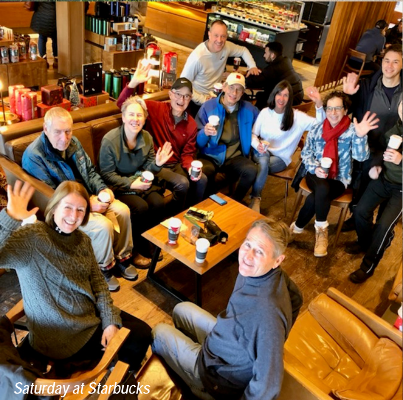
Saturday at Starbucks