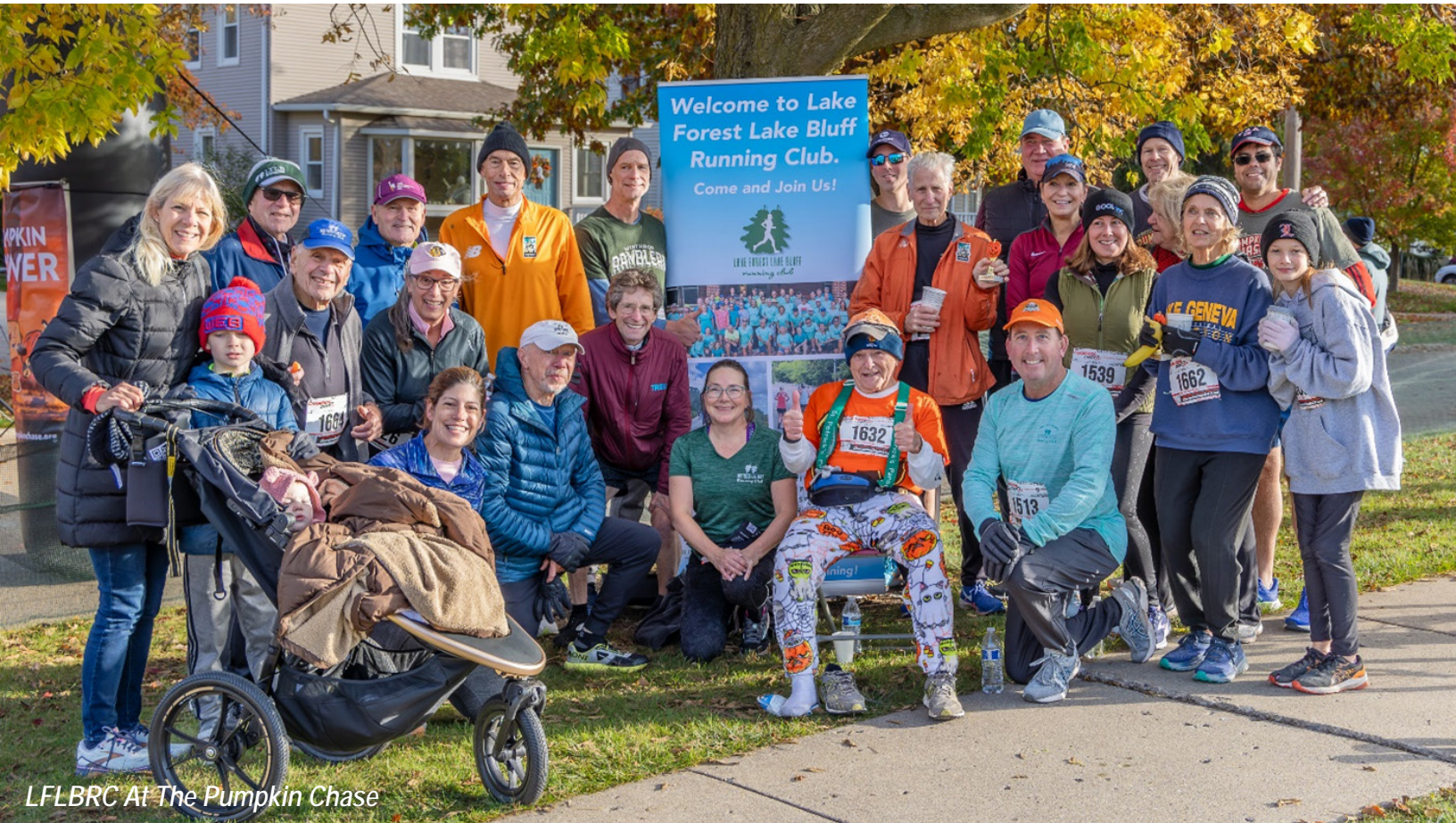
LFLBRC At The Pumpkin Chase